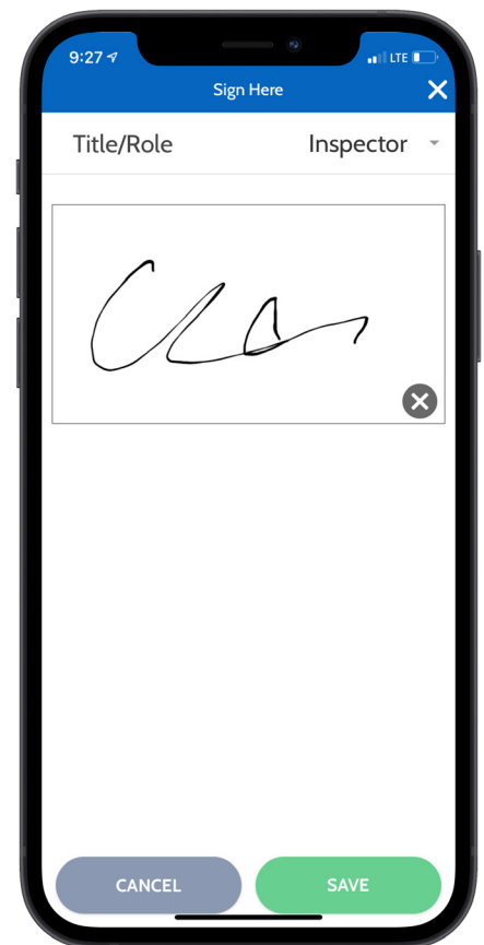
Capture worker and supervisor signatures.

How to access this tool: Visit www.HeavyConnect.com/demo